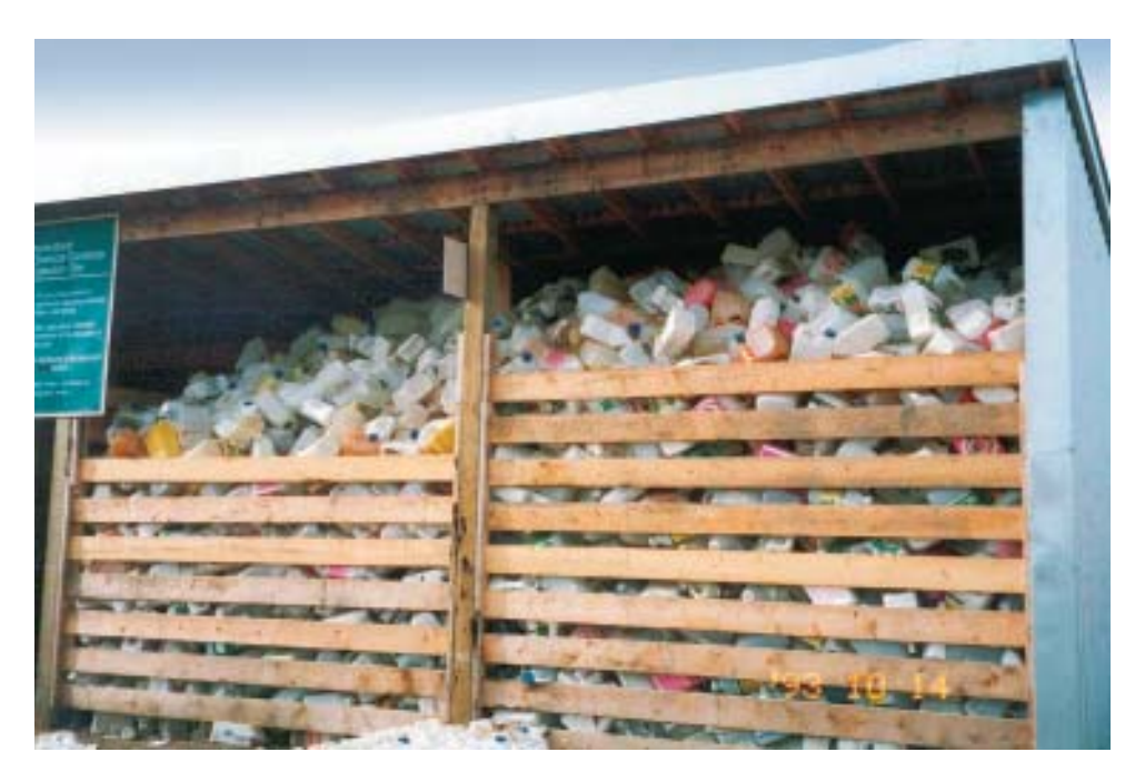
Empty pesticide containers must be disposed of at a pesticide container disposal site.

Under Alberta's Environmental Protection and Enhancement Act , non-refillable plastic or metal pesticide containers (restricted agricultural and industrial products) must be disposed of at a pesticide container collection site. A list of pesticide container disposal sites and their hours is available from each municipality, in Crop Protection (AAFRD) or from Alberta Environment.