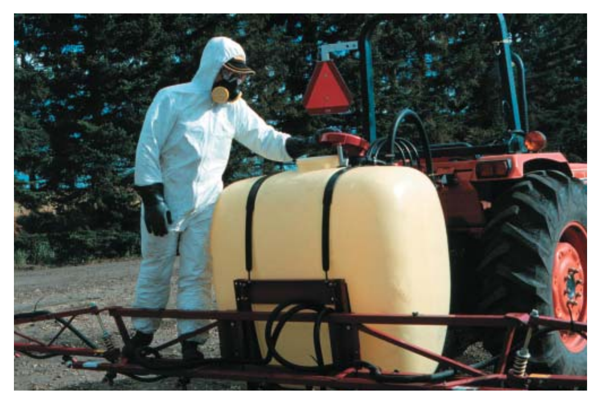
Using proper procedures and protective clothing will minimize or eliminate potential risk of contamination.