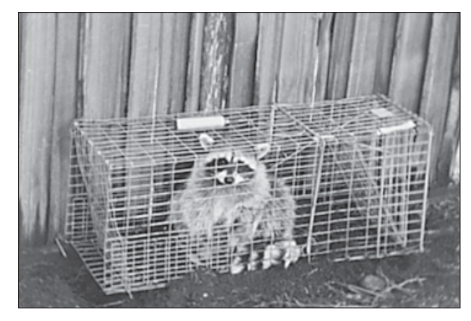
Figure 1. Wire mesh trap for live capture.

cob. Trapping success increases if bait is scattered on the trail leading up to the trap.