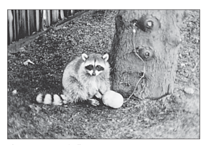
Figure 2. Egg trap for live capture.

The raccoon egg trap is a humane hand hold trap that is designed to take advantage of the raccoon's inquisitive nature and agile front paws. Lures such as jam, syrup, marshmallows or fish work well. The traps are available from some agriculture, and fish and wildlife offices or from the manufacturer: Egg Trapp Co. Inc, Box 125, Ackley, Iowa, U.S.A.