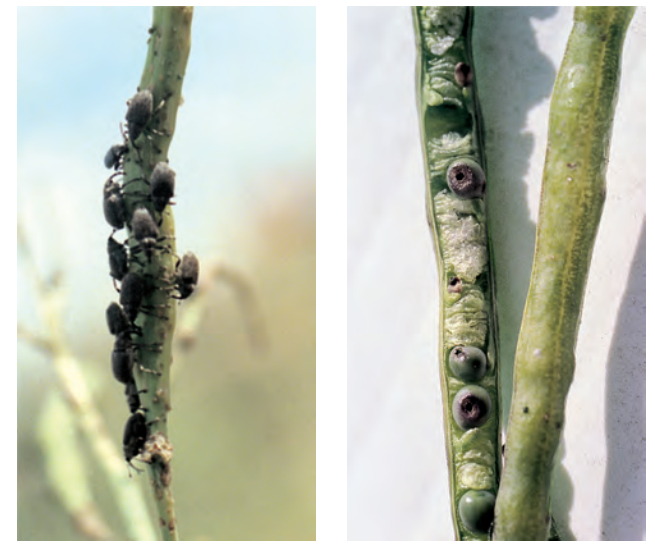
Figure 7. New generation weevil adults and feeding damage

When new generation adults emerge in late summer, they can invade nearby fields and damage the immature pods of late-seeded canola by feeding directly on the seeds through the pod walls (Figure 7).