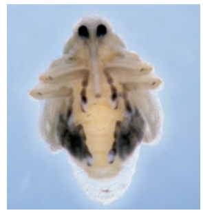
Figure 5. Cabbage seedpod weevil pupae