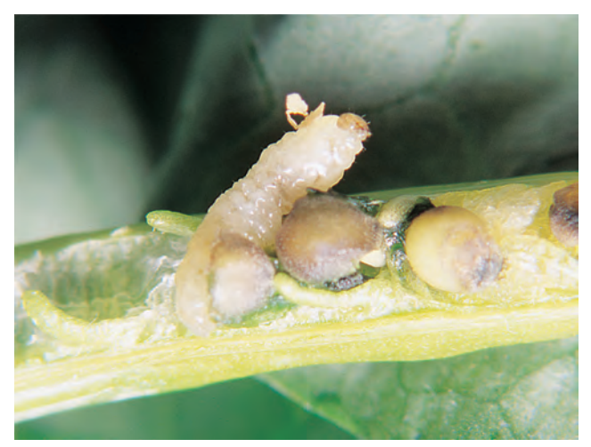
Figure 3. Cabbage seedpod weevil larva

Larval development takes approximately six weeks, and during this time, a single larva consumes five to six canola seeds. There are three larval stages (instars).