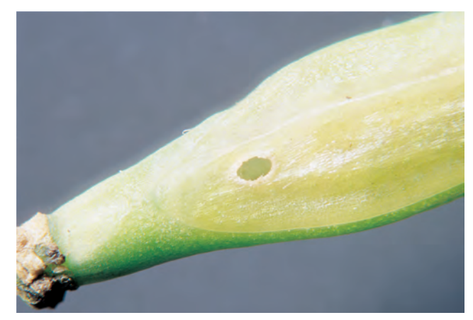
Figure 4. Cabbage seedpod weevil exit hole

Mature larvae chew small, circular exit holes in the pod walls, drop to the ground, burrow in and pupate within earthen cells (Figure 4). New generation adults emerge about 14 days later and feed on immature canola or other green cruciferous plants until late in the season when they enter overwintering sites.