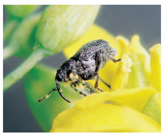
Figure 1. Adult cabbage seedpod weevil on canola

The cabbage seedpod weevil ( Ceutorhynchus obstrictus ) was introduced to North America from Europe about 70 years ago. The weevil was discovered in British Columbia in 1931, and from there, it dispersed south and eastward. It now occurs throughout most of the temperate region of the United States.