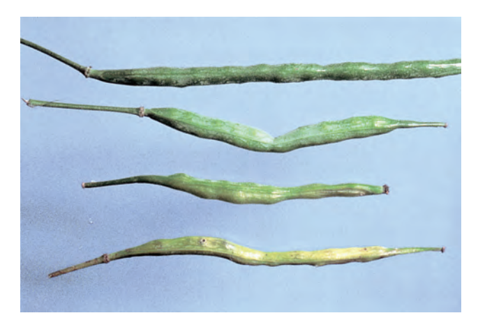
Figure 6. Normal canola pod (top) and pods distorted by internal feeding damage from cabbage seedpod weevil larvae

Canola pods harboring cabbage seedpod weevil larvae often appear distorted. When larvae consume some seeds within pods, the undamaged seeds enlarge and mature, often leaving misshapen pods (Figure 6).