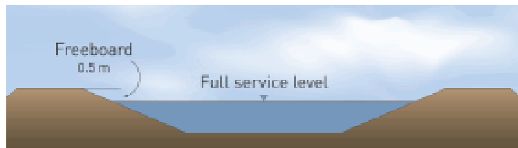
Figure 1. Catch basin filled to capacity

Runoff from the CFO is collected in the catch basin. The catch basin volume is calculated using the drainage area, the regional rainfall data and a runoff coefficient. Minimum volume requirements for the catch basin must contain runoff from a one in 30 year probability rainfall event, plus have additional freeboard of not less than 0.5 m. Freeboard is measured from the top of the catch basin to the full service level.