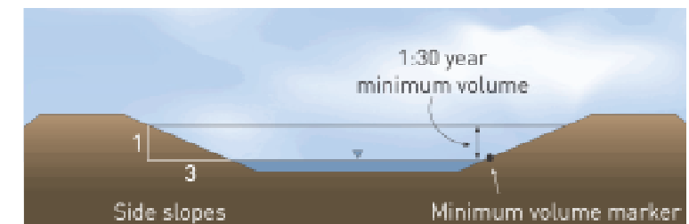
Figure 3. Side slopes and minimum volume marker

BMP: While not regulated all catch basin side slopes should have a run to rise ratio of 3 to 1, or flatter. This ratio reduces the risk of the sides sloughing in and allows people and equipment to safely access the facility without damaging the liner.