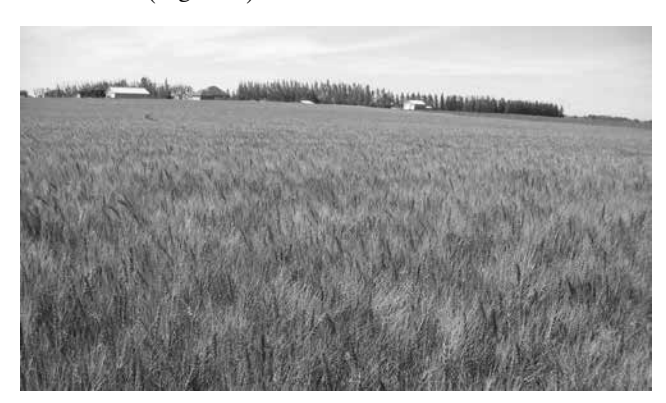
Figure 2. A well-irrigated winter wheat crop (variety: Radiant) near Lethbridge, Alberta, on August 18, 2009 (96 bu/ac).

About 80 mm of water is required to carry winter wheat from soft dough to physiologic maturity in southern Alberta. No irrigation water is needed once the heads have completely turned colour from green to brown since the crop is mature at this point and yields have been established (Figure 2).