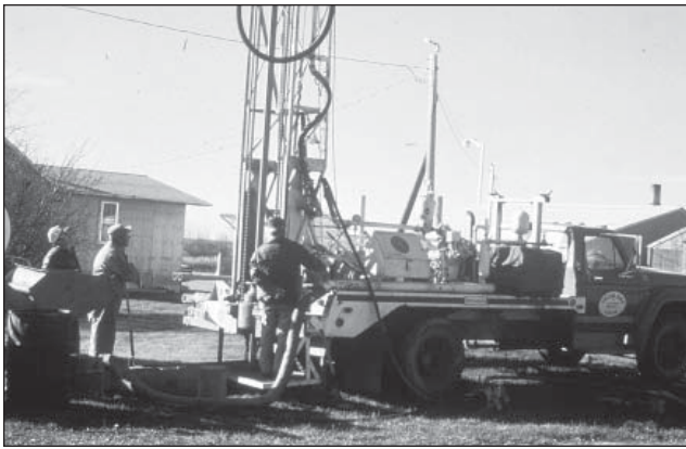
Figure 7. Test drilling to locate groundwater aquifers