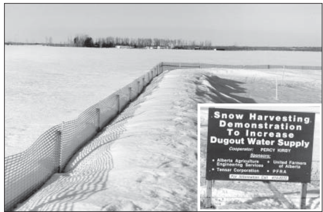
Figure 4. Plastic snow fence placed around the perimeter of a dugout