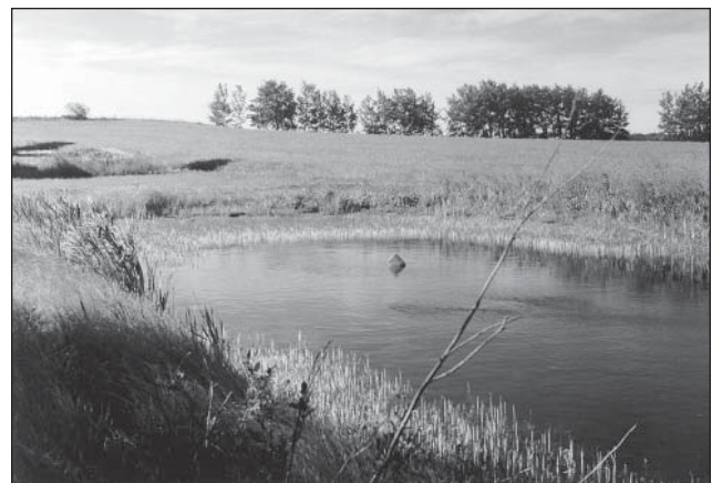
Figure 1. Water is essential

Water is essential to all human activity (Figure 1). The way water resources are managed will determine the future of the prairie economy. Water sourcing and access have been the primary goal of three rounds of Alberta and federal cost-share programs and have been used by over 15,000 applicants since 2000.