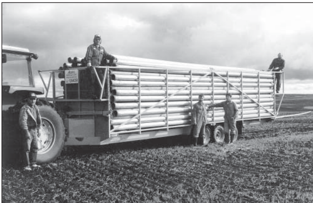
Figure 3. Water pumping program