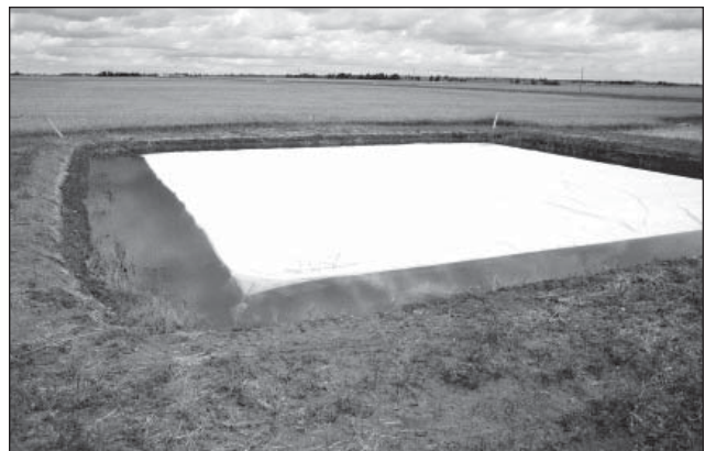
Figure 5. Plastic cover to reduce dugout evaporation losses