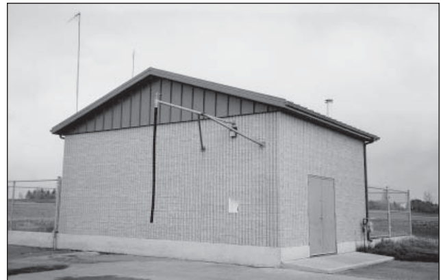
Figure 6. Tank loading facilities

Many farmers have tried unsuccessfully to solve all water supply problems on their own farms. Group projects may be a better alternative.