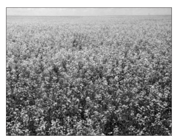
Figure 5. Same field as Figure 4, with 2 plants per square foot. Photo taken one month later, July 7.

Uniform densities as low as 10 to 15 plants per square metre (1-1.5 plants per square foot) typically yield as well as more heavily populated mid-spring seeded canola (Figure 4 and 5).