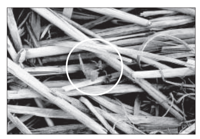
Figure 6. Severe spring frosts are more damaging to plants that have heavy surface residue beneath them.

Frost assessments should not be conducted immediately after a damaging frost (Figure 6). A minimum of five days after frost is required before a valid assessment of plant survivability is possible. At that time, the presence of a green growing point is a good indication of recovery. A healthy stem below this growing point confirms that assessment. Surviving plant densities need to meet the minimum of a green growing point.