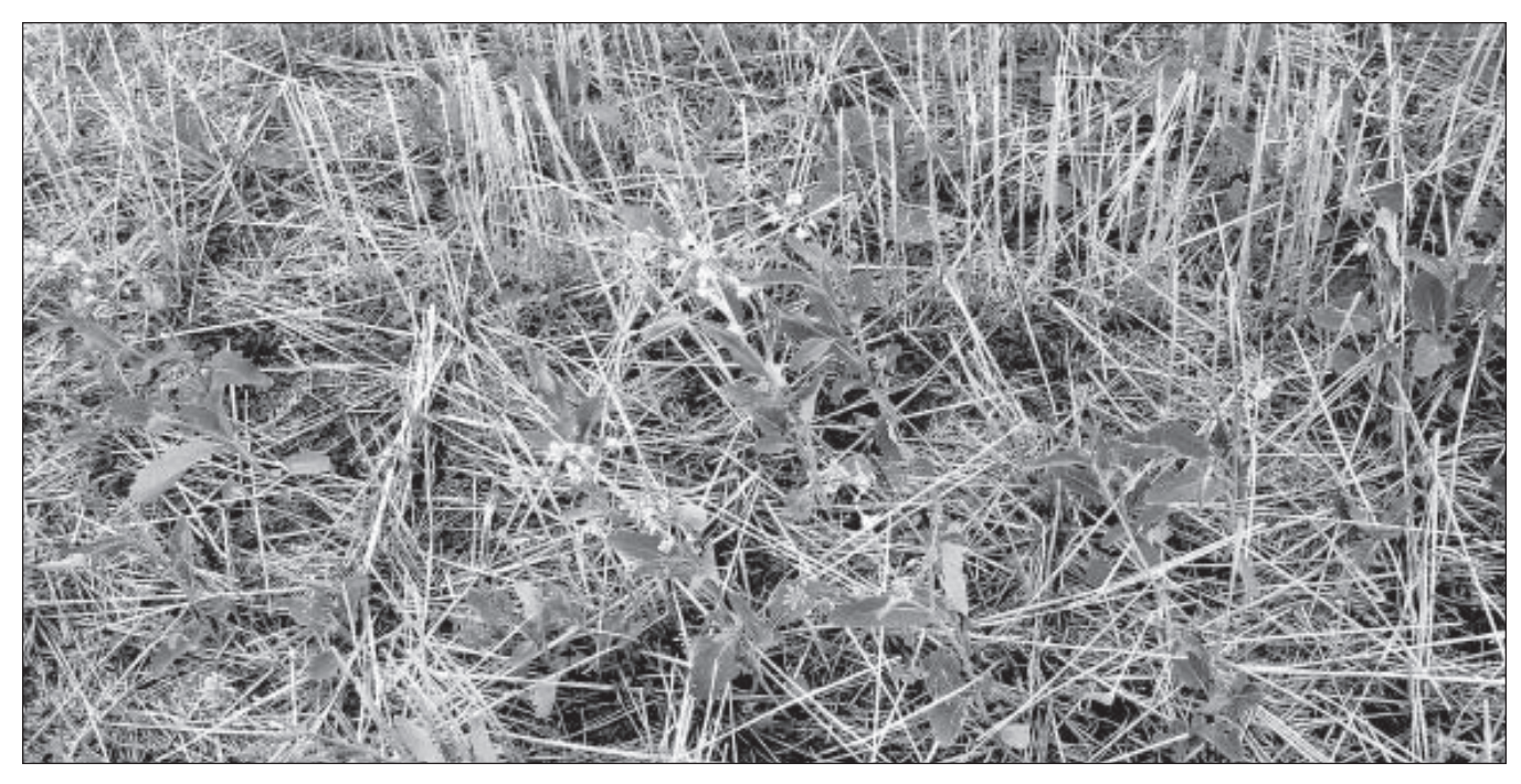
Figure 4. This plant stand averages 2 per square foot, more than enough for a good yield. Such fields look poor and barren at early growth stages. Photo taken June 8, 2000.