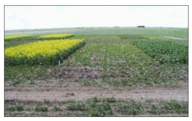
Figure 1. Fall seeded canola (left), May 15 seeding (centre) and April 27 seeded canola (right). Photo taken June 20.

Alternative date seeding, however, requires careful management. Studies and practical experience on these seeding concepts have led to the recommendations in this factsheet.