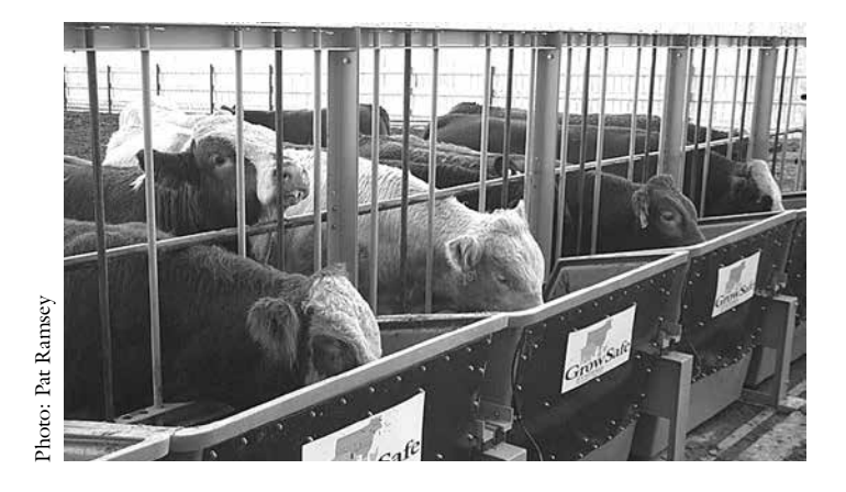
Figure 3. GrowSafe System used for measuring RFI of bulls at Olds College.