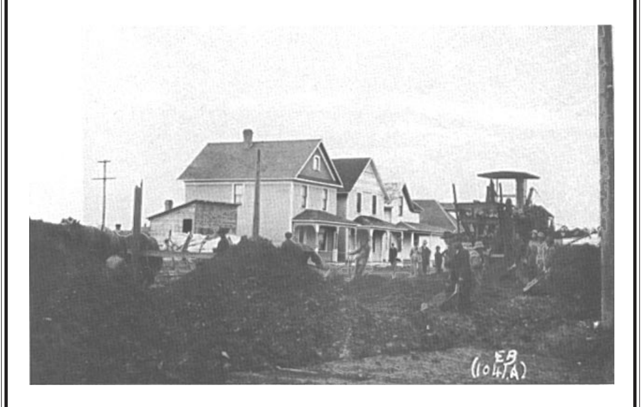
Travel in the Summer Season Could be Pleasant

Steam ditcher at work, 1907.