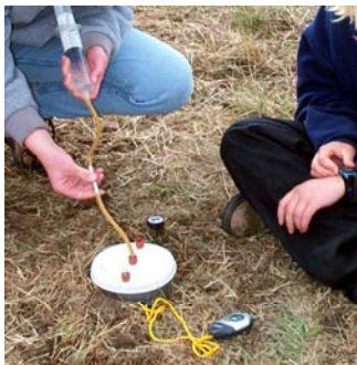
Figure 5. Respiration measurement

Soil respiration was determined 12 hours after wetting the soil during the infiltration test. Respiration was measured from the headspace of the rings, which were capped with a lid. Respiration was estimated colorimetrically by passing the headspace gas through an open CO 2 detection tube (Dräger, Germany) 30 minutes after capping of the ring (Figure 5).