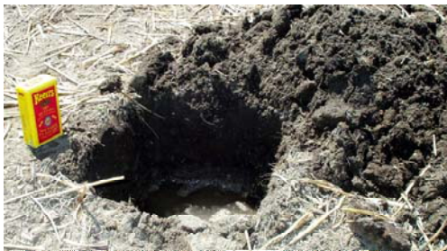
Figure 4. Earthworm concentration measurement

Earthworm concentration in the soil was estimated by digging a pit 30 cm 2 in dimension (Figure 4). The soil removed from the pit was sorted and the number of earthworms was recorded. A solution of mustard powder and water was then poured into the pit to draw out any other worms.