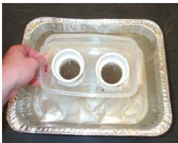
Figure 8. Aggregate stability

Aggregate stability was determined by subjecting 10 g of sieved, air-dried soil to the forces of flowing water. The soil sample was slowly wetted and then exposed to up and down oscillations in distilled water (Figure 8). The remaining water stable aggregates were dried and weighed, then were dispersed in a Calgon solution. The dispersion removed all the silt and clay aggregates, leaving the sand portion of the soil. This sand portion which remained after the dispersion was dried, then weighed and used to determine the percent of soil >0.25 mm in size.