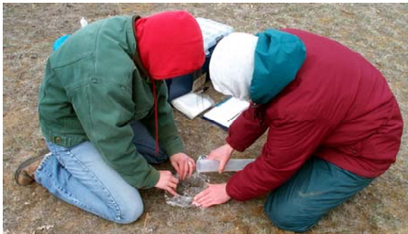
Figure 2. Infiltration test

Infiltration was determined by adding water, equivalent to 2.5 cm depth, to the aluminum rings and recording the amount of time needed for the water to fully penetrate the soil (Figure 2). The test was performed twice. The first amount of water wetted the soil so the management systems had more equal soil water contents. The second inch of water gave a more representative rate of infiltration and was used as the reported value.