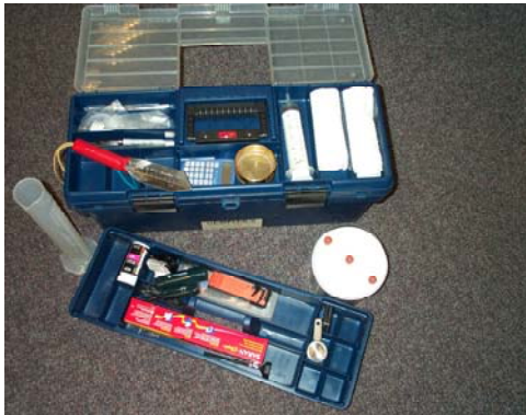
Figure 1. USDA soil quality test kit

The kit consists of a portable toolbox, which includes most of the equipment needed to complete the tests (Figure 1). It comes fully stocked, although some supplies need to be replenished such as pH calibration solution, CO 2 detection tubes and nitrate detection strips. The user must supply distilled water and a shovel and access to electricity is necessary for completion of some tests. A guide is included in the kit, which outlines each test, providing step-by-step instructions and offers an interpretation of typical results (USDA 1999).