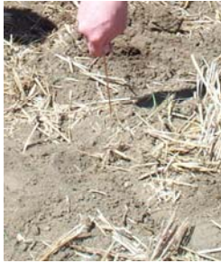
Figure 9. Depth to resistance layer

Complete analysis of the samples (9-12 samples) from each site (Foremost, Bentley or DeBolt) took place over a two-day period and was performed by two to three people. Infiltration rate test, bulk density sampling, earthworm observation and soil physical observations were completed during a five hour period on the first day. During the second day, the soil respiration, pH, EC, nitrate and aggregate stability tests were conducted. The soil sub-sample collected from each site must be air dry before it can be analyzed for pH, EC and aggregate stability on the second day.