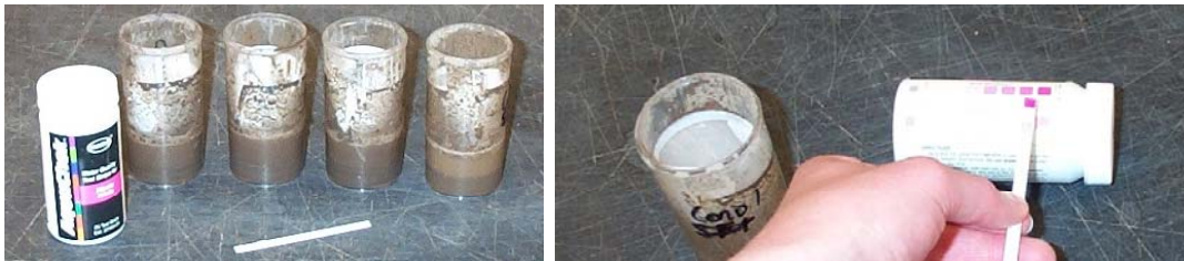
Figure 7. Nitrate determination

Immediately following the pH test, the solution was passed through filter paper for nitrate determination. Soil nitrate concentration of the filtrate was estimated colorimetrically using AquaChek Nitrate/Nitrite water quality test strips (Environmental Test Systems, Elkhart, IN) (Figure 7). The test kit provides two measurements of nitrates, estimated and exact nitrate concentration. Calculation of exact \text{NO}_3\text{-N} takes into consideration the volume of water and weight of soil used, while the estimated \text{NO}_3\text{-N} calculation does not. By including the volume of water and weight of soil used, a more precise measurement of nitrate concentration can be achieved.