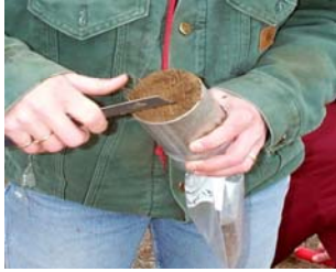
Figure 3. Bulk density measurement

Earthworm concentration in the soil was estimated by digging a pit 30 cm 2 in dimension (Figure 4). The soil removed from the pit was sorted and the number of earthworms was recorded. A solution of mustard powder and water was then poured into the pit to draw out any other worms.