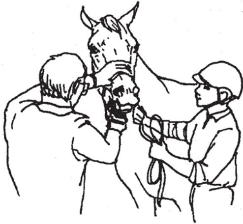
Veterinarian examining the horse's mouth.

A qualified veterinarian can help assess the athletic ability, soundness and conformation or structure of the horse with a pre-purchase exam.