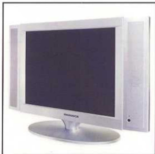
Television (All Sizes)