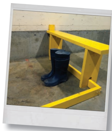
A simple crossover station at the entrance and exit to isolation. Physical barriers serve to remind people to change footwear, outwear and wash hands prior to entering and upon exiting quarantine and/or isolation

Disinfectants require contact time with surfaces to be effective. Check manufacturer's directions.