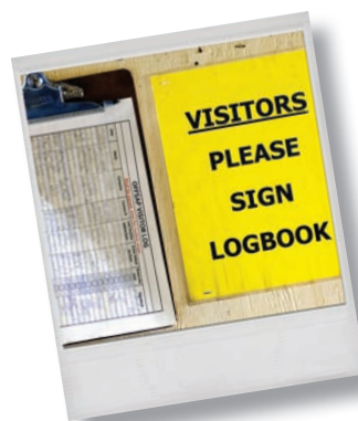
A visitor log or guest book can be used to track human movement in the event of a disease outbreak

Where might you make changes to accessing your farm, barn and horses?