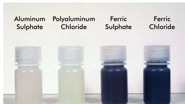
The various coagulant chemicals are aluminum or iron dissolved in sulphuric or hydrochloric acid

All four chemicals are available as liquid solutions from distributors in 205 L (45 gallon) drums or at select companies in 20 L (4.5 gallon) pails. In addition to the chemical cost, a deposit of $60 for the 205 L gallon drum is charged and refunded when the empty container is returned. The cost of chemical in 20 L pails is double when compared to purchasing the chemical by the drum.