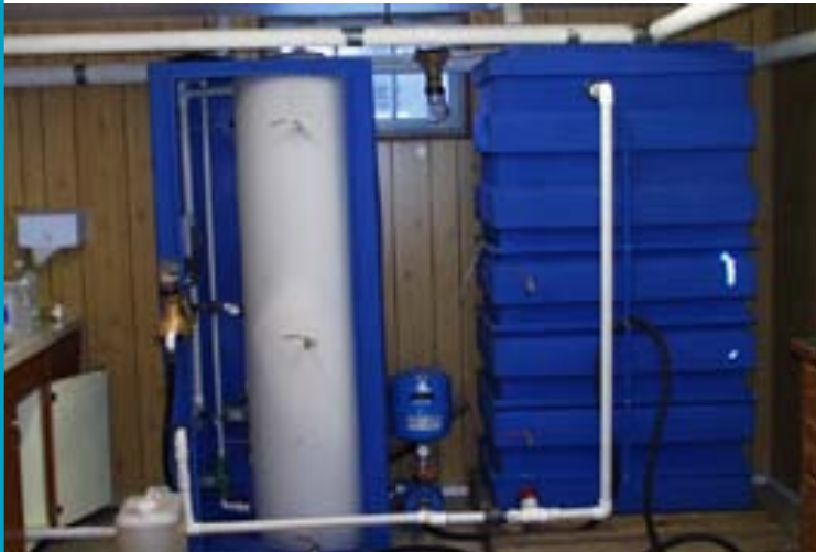
The in-house coagulation system commonly uses polyaluminum chloride