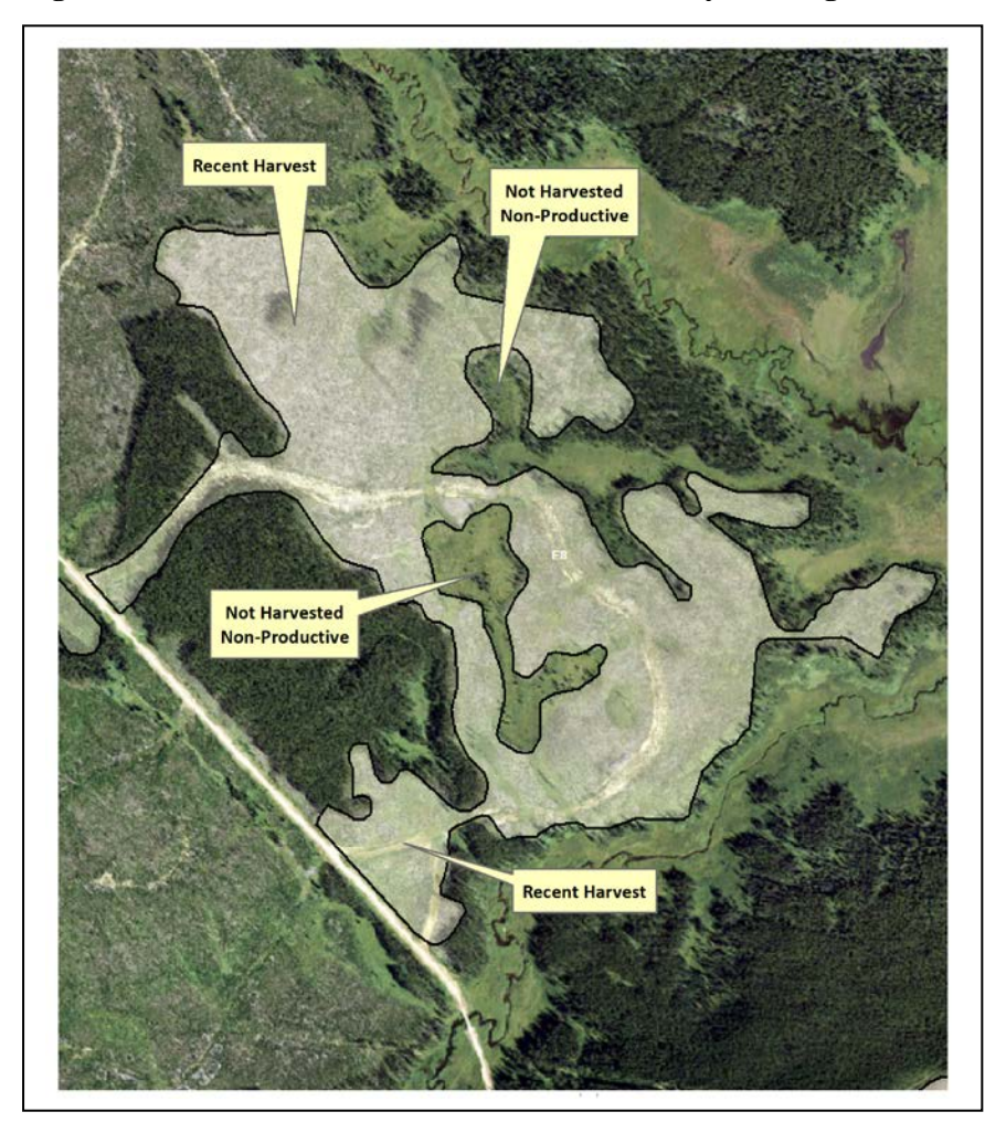
Figure 4-5: Cutblock differentiated from naturally non-vegetated areas

Any naturally non-vegetated polygons 0.5 ha in size within the boundaries of or adjacent to the cutblock polygon are excluded from the depletion polygon.