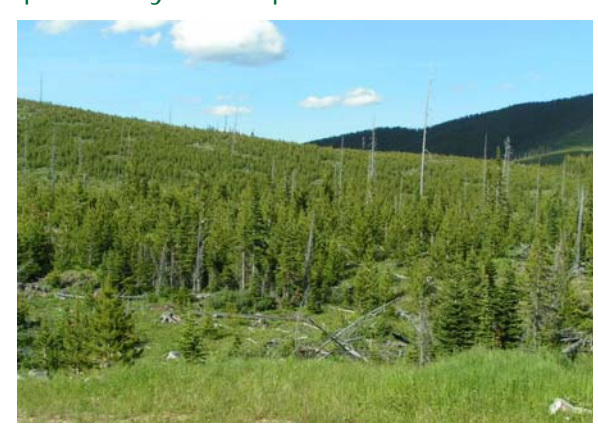
Figure 3. An example of a reforested area inspected by the department

All FOMP inspections are recorded in Alberta's Geographic Land Information Management and Planning System (GLIMPS) database. All noncompliant activities resulting in enforcement actions are recorded in the provincial Incident Reporting System (IRS) database.