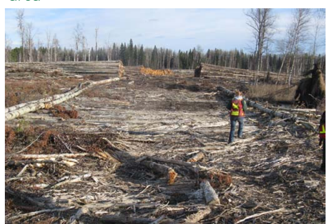
Figure 2. FOMP auditor inspecting a harvested area

SAM involves comparing samples of records from the Alberta Regeneration Information System (ARIS) database with the forest company's