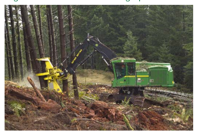
Figure 1. A timber harvesting operation

harvesting and reforestation activities to ensure they meet required provincial standards (Figure 2).