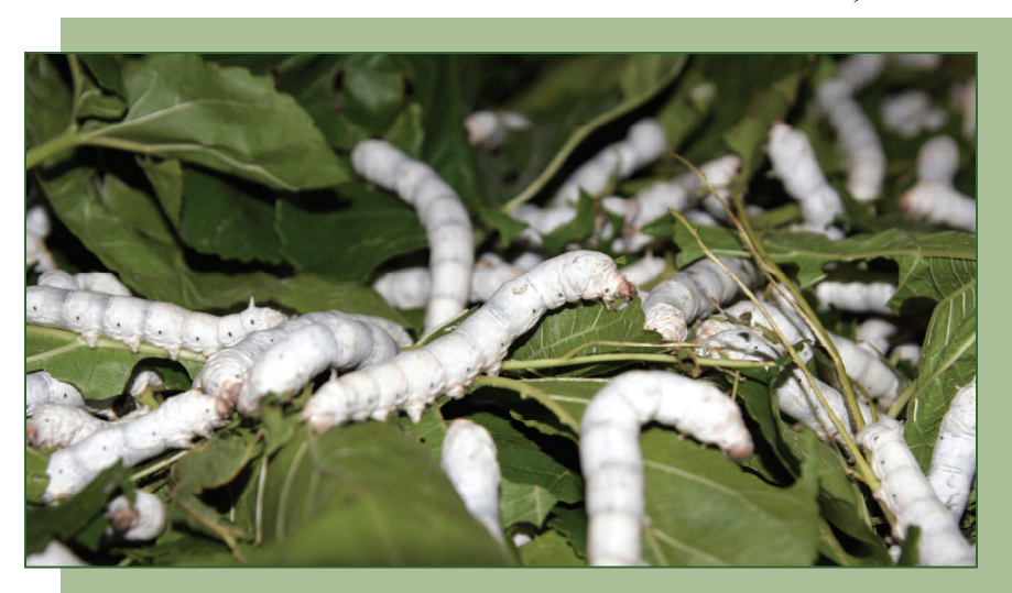
Acclimatisation societies participated in import/export of utility insects such as honeybees and silkworms.

In June 1860, the Acclimatisation Society of the U.K. held