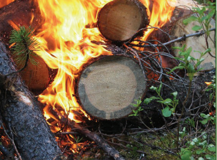
Burn beetles burn! Note the characteristic ring of blue stain fungi in the sapwood of this MPB-infested log.

It is the department's goal to treat 100% of MPB-infested trees that are detected.