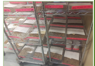
Extracted seeds: 1 tray per tree

Are we going to hoard all this seed away in the provincial seed vault? Some will be kept for long term genetic conservation. The rest will be used to grow lots of seedlings for restoration, hoping they will thrive and grow to produce their own cones in nature. Some seeds may be used to support research projects with partner agencies.