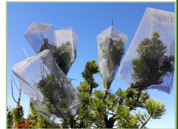
Caged whitebark cones

The final tally was 4,914 cones from 113 trees. For a normal tree that's not much. But since each cone needs to be manually protected from predation by a mesh cage early to collect these delicious and valuable seeds and then revisited to collect in late fall, nearly 5,000 cones is an impressive haul.