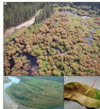
A & B) Willow with red foliage. C) Willow leafminer larva removed from within leaf.

More than 2 million hectares of forest disturbance were mapped in 2018 (Table 1), an increase of 25 per cent from 2017, primarily due to increased bark beetle, defoliator activity and abiotic damage. Aspen defoliators were responsible for 35 per cent of the total damage mapped. Large aspen tortrix populations expanded again this year, up 73 per cent, to 508,814 hectares. Bruce spanworm is responsible for some of the defoliation attributed to large aspen tortrix - these two species overlap and it is difficult to distinguish between the two defoliators from the air. Forest tent caterpillar was very active in the southern part of the Lac La Biche Forest Area, but provincially the area defoliated decreased by 30 per cent compared to 2017. Spruce budworm defoliation increased for the first time since 2014, mostly in High Level Forest Area, but remained predominately moderate in severity. Willow leaf-blotch miner activity has been observed in the northern reaches of the province since 2013—2018 is the second consecutive year that defoliation was formally reported. Red areas on the leaf (photo right) result from feeding by the larva within the leaf.