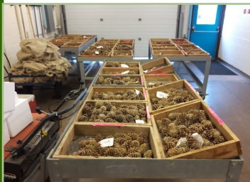
Limber pine cones: 1 box per tree

The final number is still being tallied, but a sample yielded around 175,000 limber pine seeds from 100 trees and around 15,000 whitebark pine seeds from 13 trees (give or take 10-20%).