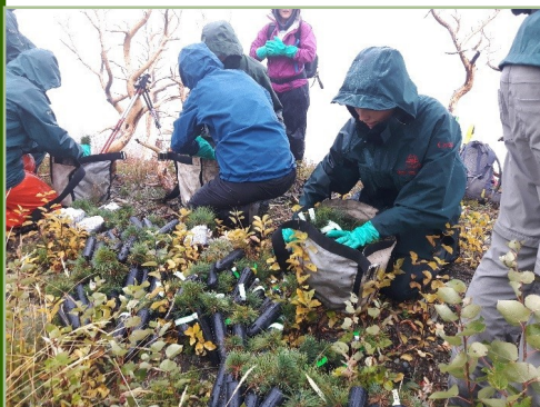
Getting ready to plant seedlings

Two field sites with monitoring transects were planted this fall with 1,050 tested resistant limber pine seedlings: half in Waterton Lakes National Park, and half in the Castle Wildland Provincial Park. About 7,800 limber pine plus tree seedlings will be ready to plant in fall 2019, and more whitebark pine and limber pine seedlings will be available in the following years.