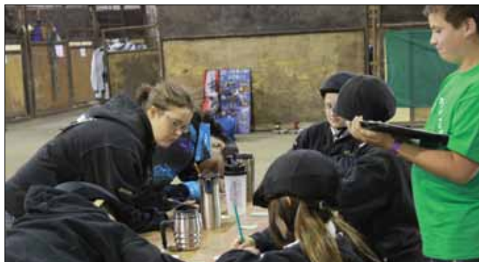
Members participate in consumer decision making at Peace Regional Days.

new Specialist is in place. If you see something that you have the skills to help out with, please step forward. ✿