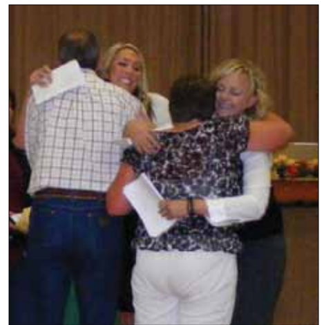
Left: 2010 scholarship recipients.

As we look forward to a new year, our Southern members will be able to swing