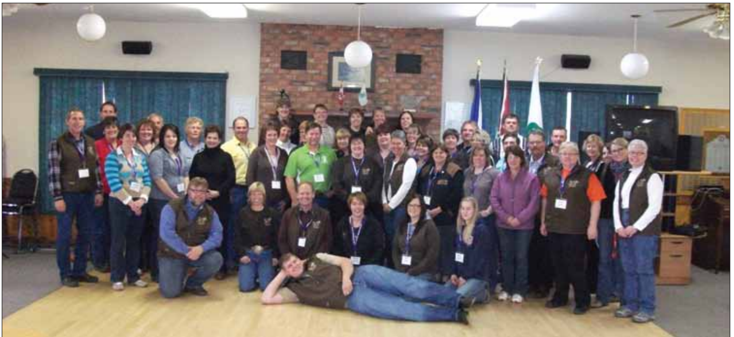
2010 BUD Participants