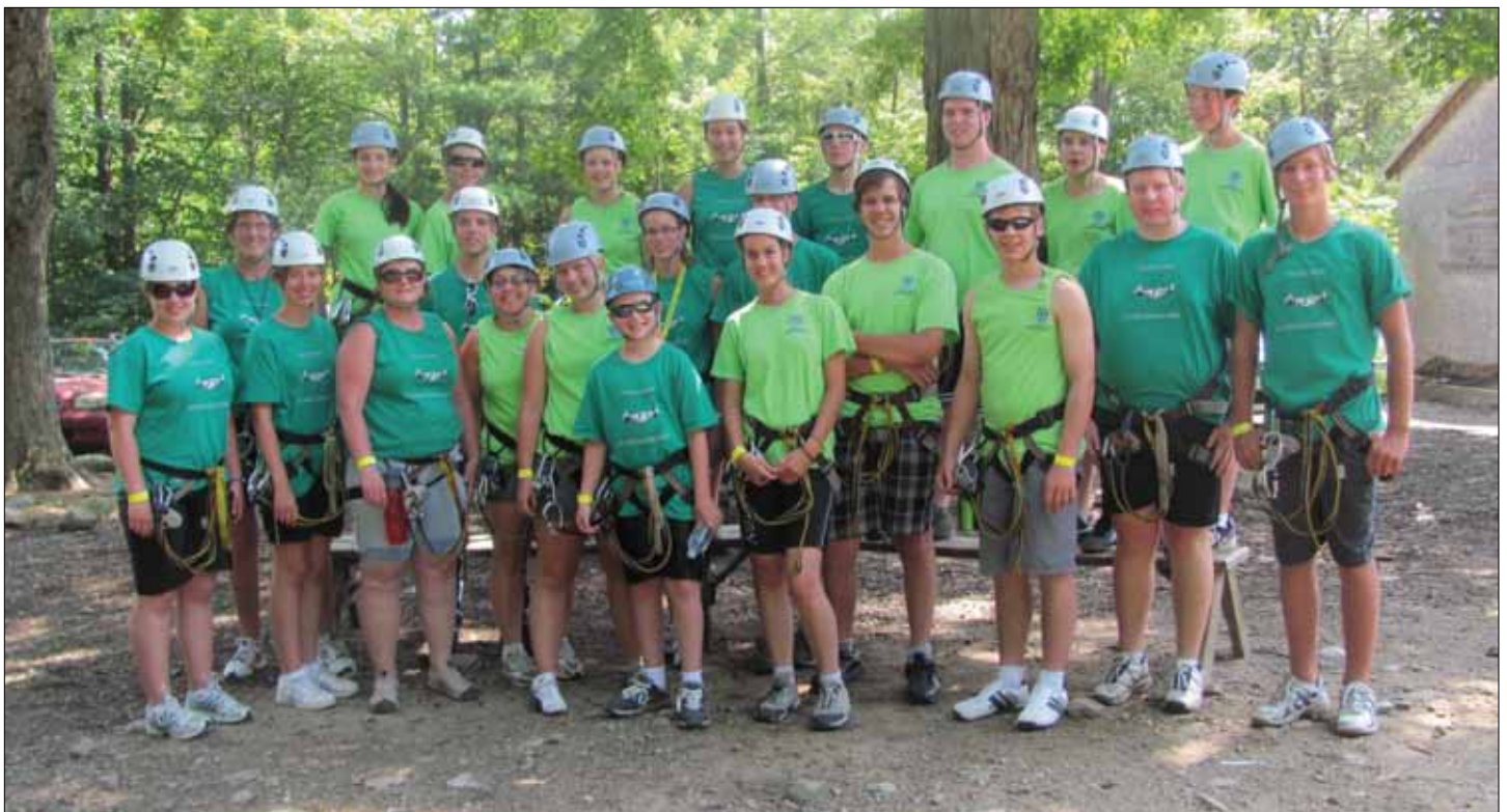
Exchange delegates at Arbraska Outdoor Adventure Park in Quebec.

We would like to extend our thanks to all our donors and sponsors that supported our fundraising efforts in Alberta making this whole experience possible with a special thank you to the Canadian 4-H Council, and the Department of Canadian Heritage for providing all air transportation for not only our group, but for all Canadian 4-H clubs participating in the exchange program this summer! 🍀