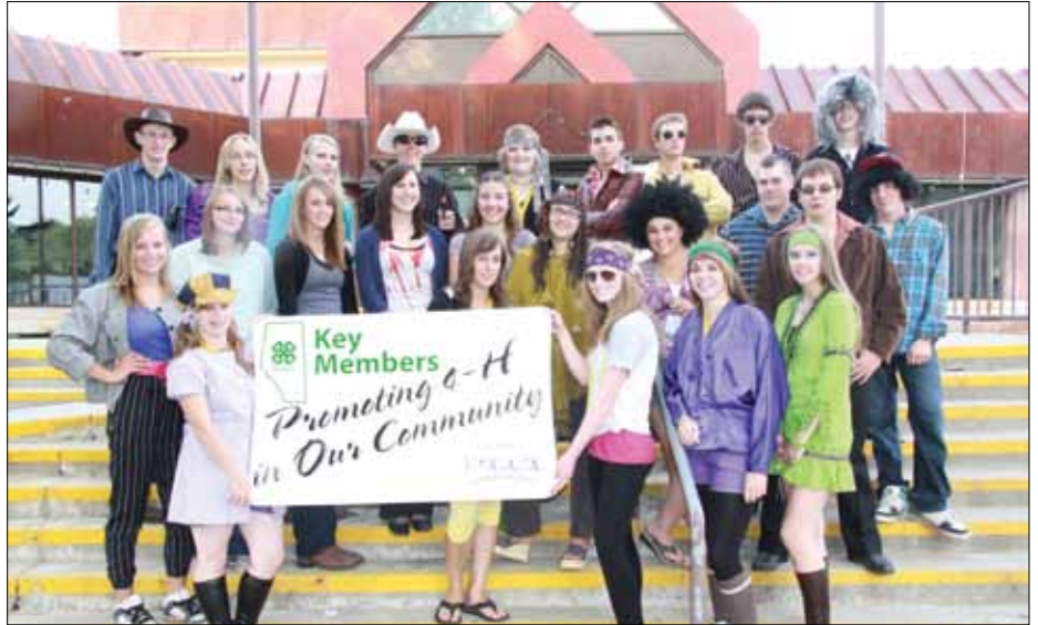
2010 Alberta 4-H Key Members, decked out in disco gear for Saturday night's dance.