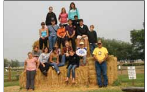
Bus trip adventures.

It was a busy summer but we had so much fun! We are excited to get this year on the way to see what next summer brings us! 🍀