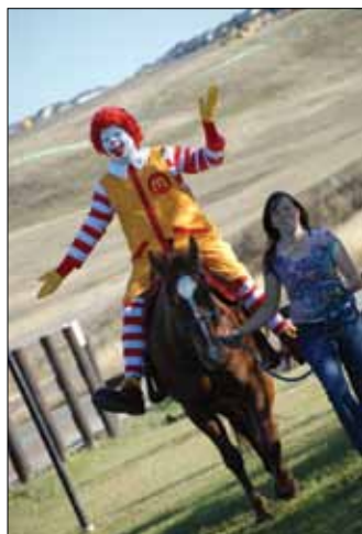
Ronald McDonald tries his hand at becoming an equestrian.