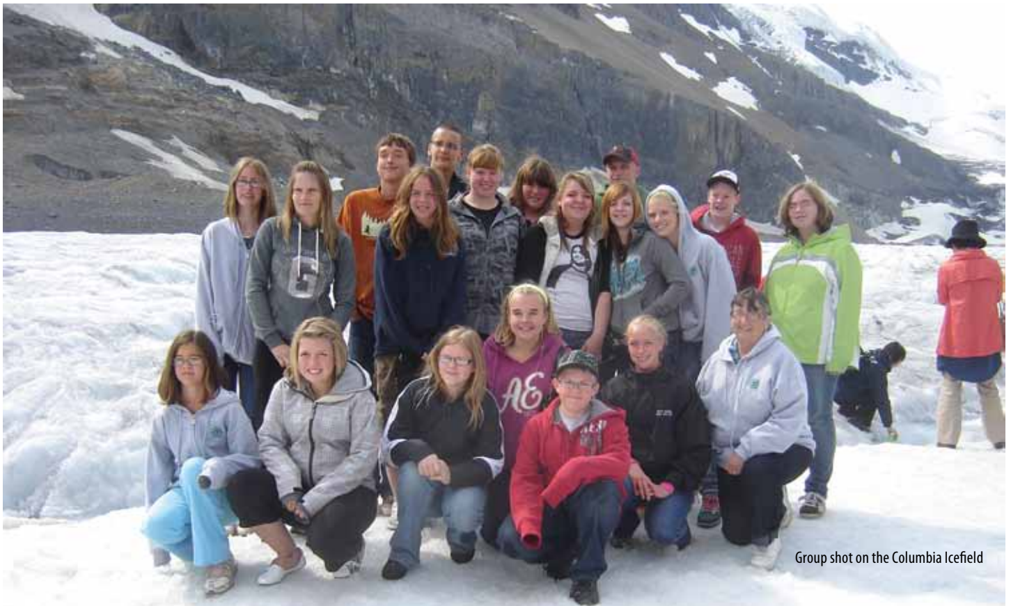
Group shot on the Columbia Icefield