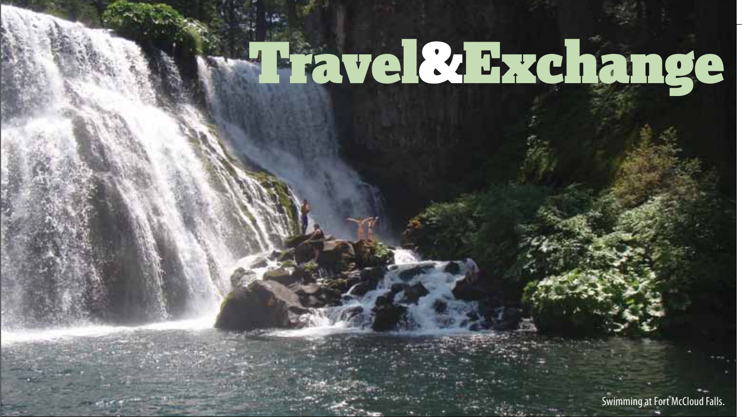
Swimming at Fort McCloud Falls.