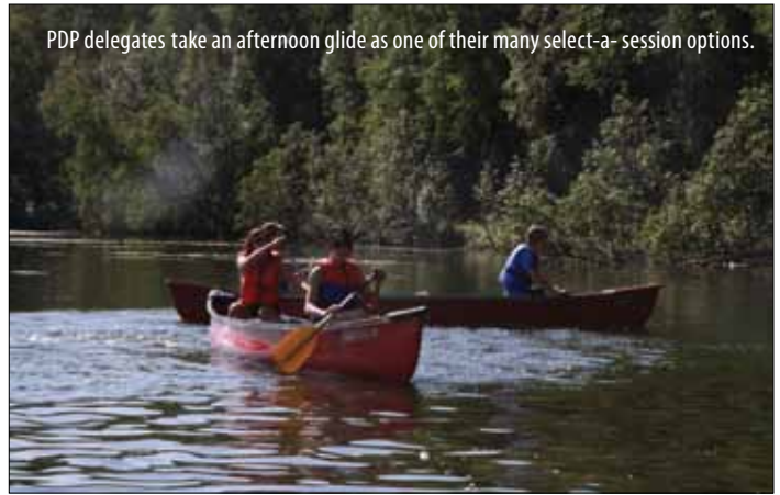
PDP delegates take an afternoon glide as one of their many select-a-session options.

In addition, PDP Plus delegates took to the task of creating and planning a community event. Delegates, who had been put into groups with members from their district, came up with a diverse offering of ideas, ranging from environmental aware-