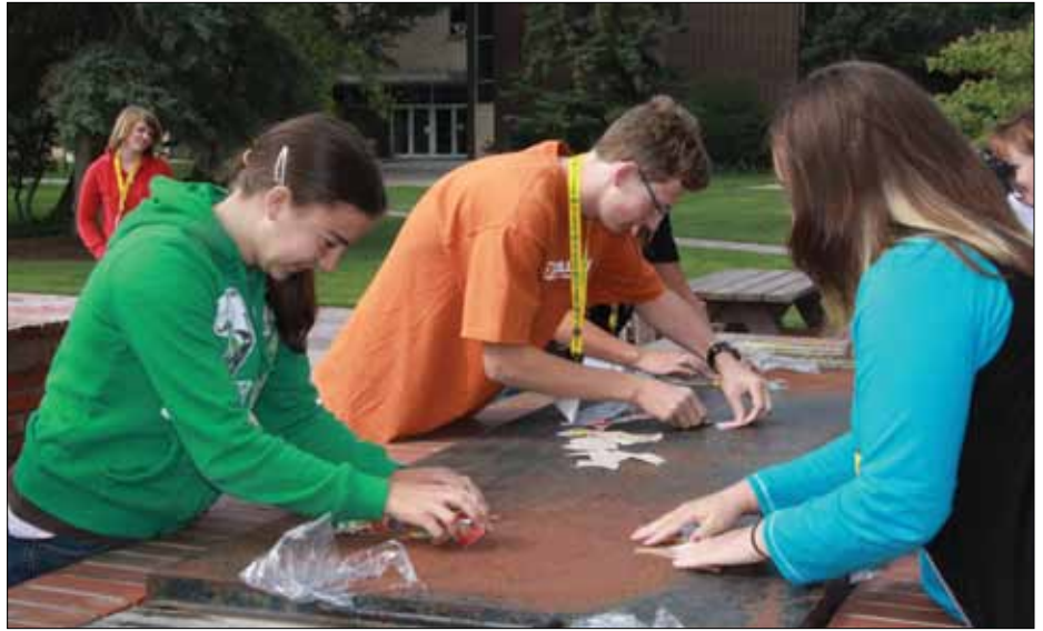
Key Members work to assemble puzzle pieces for an outdoor activity.

Presenting Partner for the Key Member program is Encana Corporation. Partner Supporters are Agrium Inc. and Government of Alberta. Partner Host is Lakeland College. 🍀