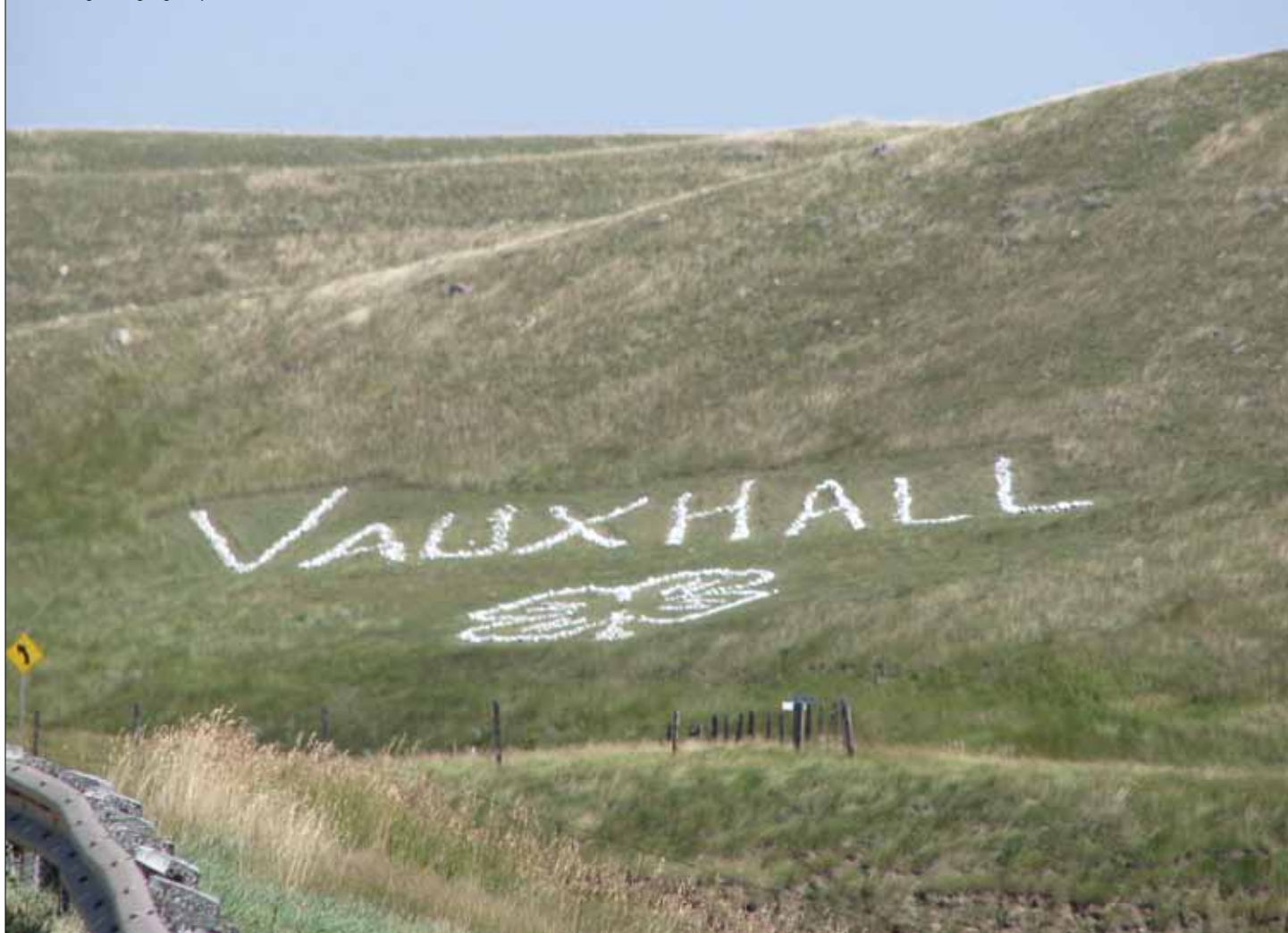
The road sign along Highway 36.