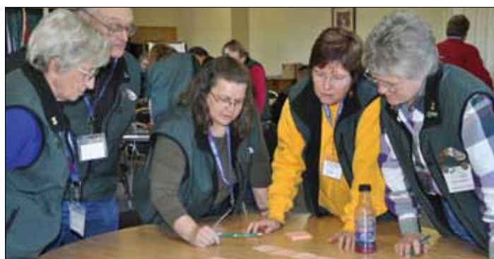
Key Leaders hone their teamwork and problem-solving skills.