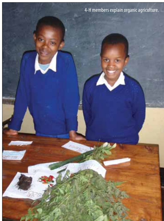
4-H members explain organic agriculture.

I would like to thank the S.M. Blair Family Foundation and Alberta 4-H for their support to attend this conference. 🍀