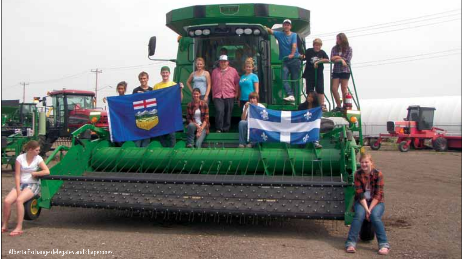
Alberta Exchange delegates and chaperones.