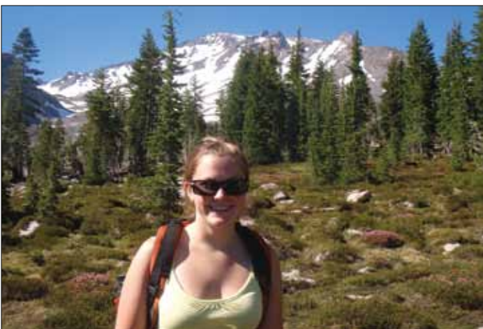
The top of Mount Shasta (wooh, it's a volcano!)

After attending the State Leadership Conference I feel I have acquired new skills that I can apply to my club and Ambassador team, plus I have some new moves for the next 4-H dance! ❀