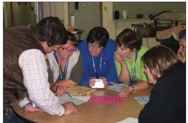
Leaders hard at work at the 5 th Biennial BUD Weekend

UFA Cooperative Limited is the Presenting Partner for BUD, with Partner Supporters being as follows: Alberta Beef Producers, AMA Insurance, Canadian Cattlemen's Association, Government of Alberta, Growing Forward, Ketchum Manufacturing Inc., Kubota Canada Ltd., Lakeland College, Lammler's Western Wear & Tack, and Servus Credit Union. Partner Host is the Alberta 4-H Centre. 🍀