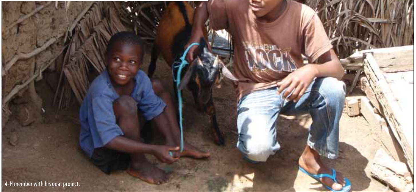
4-H member with his goat project.