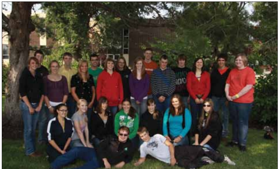
Key Members at the 2010 training workshop weekend.