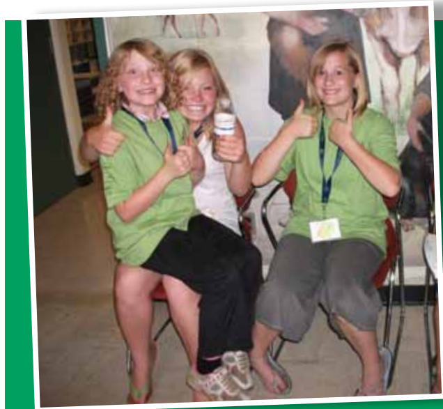
See? These keen cats were already in the green spirit of things this summer, at Horse Classic 2010.

Visit www.4-h-canada.ca/store today to find out more and suggest new products you want to see stocked!