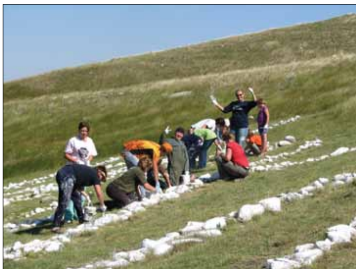
Current day 4-H members maintain the work of 4-H members from some 45 years prior. Photos Credit: Joan Wallace, Hays 4-H Club

It is hard to miss the large rock sign that has greeted commuters along Highway 36 for the past 50 years. The town name of Vauxhall, with the 4-H Clover below, marks the commitment of area 4-H clubs, past and present.