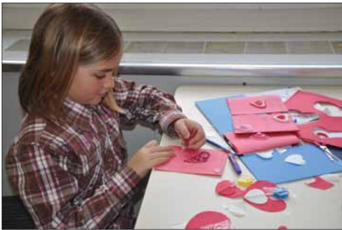
A future 4-Her tries her hand at a Valentine's Day craft card.