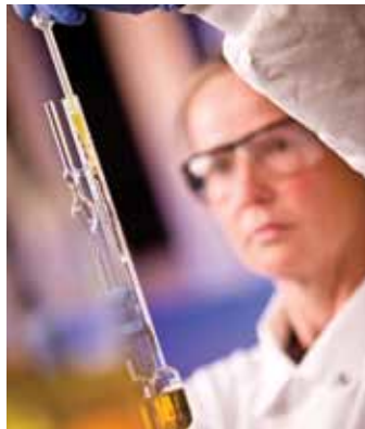
MacEwan University Bachelor of Science (one-year at Olds College)