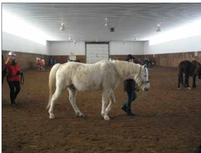
Groundwork during the recent natural horsemanship clinic.

The regional competition will award up to two $100.00 awards each year. Competition rules and details can be found on the Alberta 4-H webpage under "Regional Info" (select Calgary region on the province map, then select "Info"). 🍀