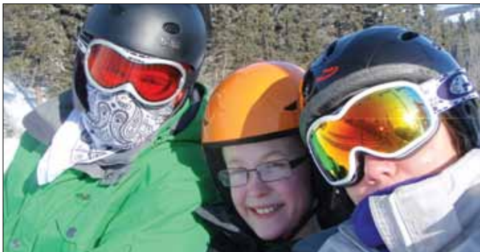
The hill was so bright, they had to wear shades.

Remember that the second MNP South Regional Judging Competition will take place in Claresholm on Thursday, April 28 during Easter vacation. See you all there!