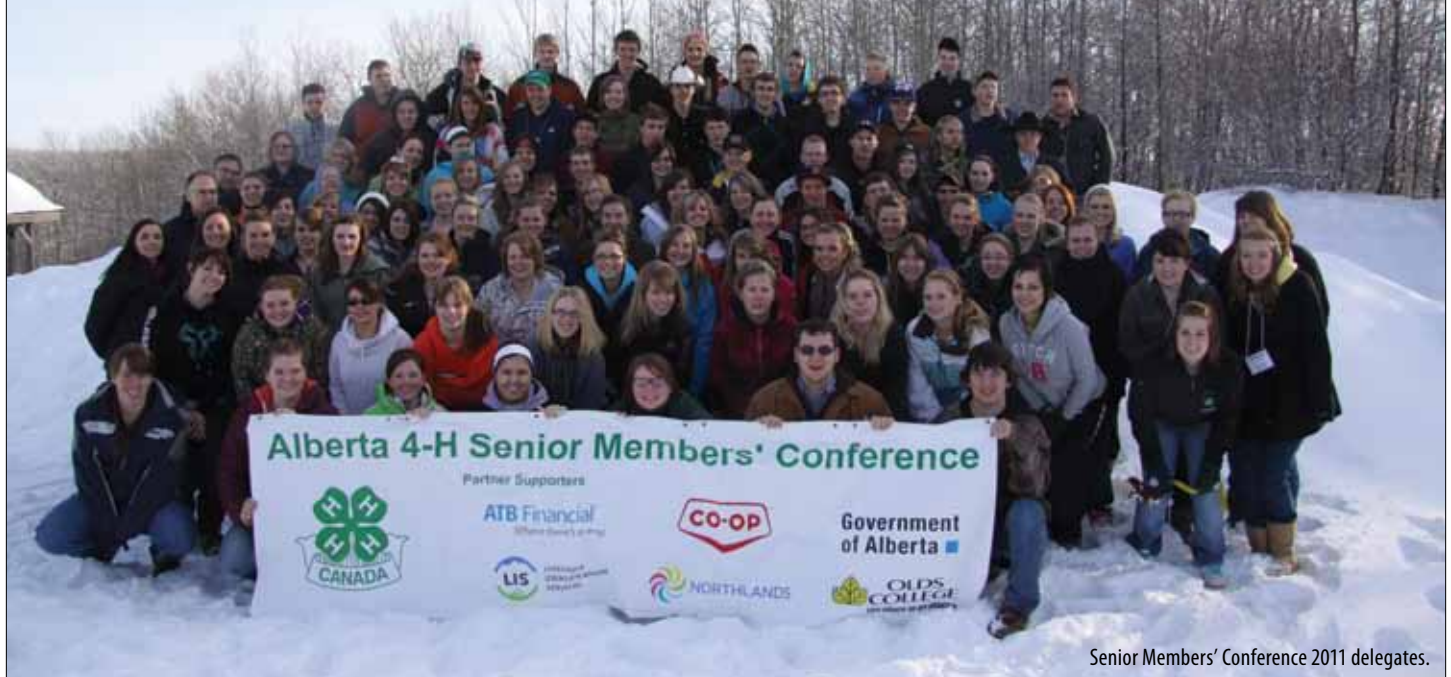
Senior Members' Conference 2011 delegates.

4-H Specialist – Resource Development and Communications