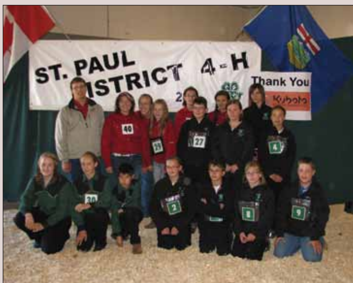
Members kicked off the show by gathering together and reciting the 4-H Pledge.

Grand/Reserve awards for yearlings, two-year olds, and supreme female: sponsored-embroidered jackets.