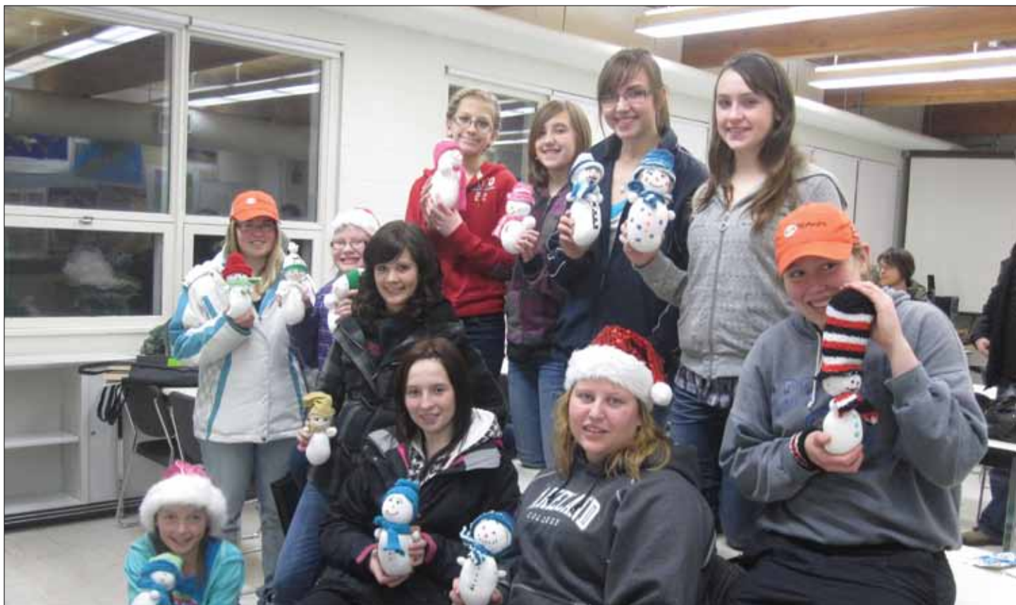
Members of the Vermilion Golden Threads 4-H Multi Club show off their wool sock snow(wo)men.