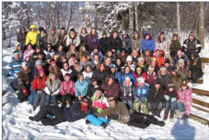
Frosty Fun 2011 delegates.

Once the regional communication competitions are completed in February and March, members continue using their communication skills at judging competitions and workshops through-