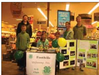
Annnnd, their Safeway display.