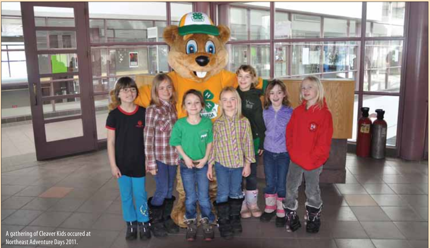
A gathering of Cleaver Kids occurred at Northeast Adventure Days 2011.