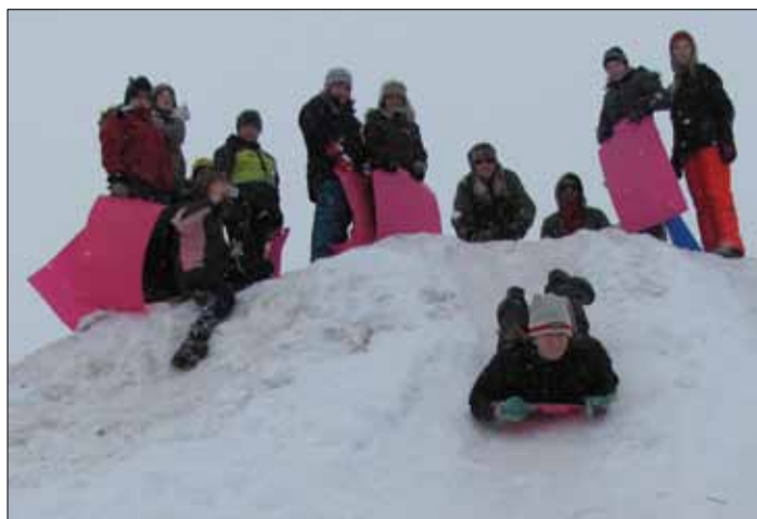
Oh, a sledding we will go at Frosty Fun Winter Camp.

August means it's time for Northwest Junior and Intermediate members to pack their suitcases and sleeping bags for a week of camping with their regional 4-H friends. Intermediate-aged members will head to Camp Lessard in Lac Ste Anne County, August 7 to 12. Camp Mackinicholea, located on the north shore of Long Island Lake, welcomes all junior campers August 16 to 20 for their first experience at a 4-H camp. For $100, members have the opportunity to participate in these regional camps if they register by May 15.