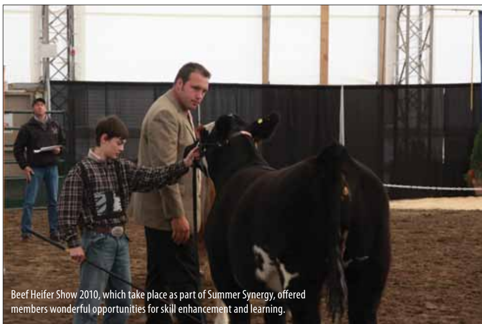
Beef Heifer Show 2010, which take place as part of Summer Synergy, offered members wonderful opportunities for skill enhancement and learning.

Leadership development opportunities have been and will continue to be a focus of the Branch, with these above projects and initiatives being just a taste of what we've been doing in terms of programming and resource creation. We would love your feedback on how you feel we're with building leadership capacity in rural Alberta. Feel free to email us your thoughts and opinions at info@4h.ab.ca or, "like" us on Facebook. Either way, let's be in touch. ❁