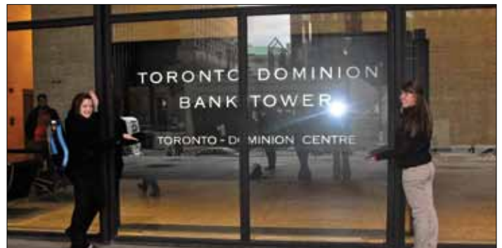
It's official: this group was definitely in Toronto.

On the final day, we said goodbye to the National 4-H Members' Conference, Toronto, and our new friends that we'll never forget. 🍀