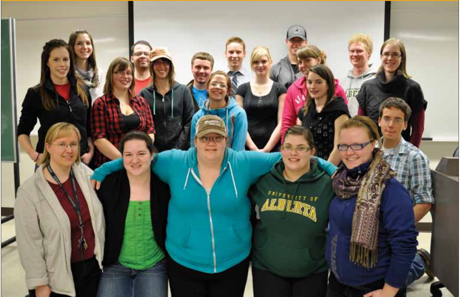
Members of the first-ever collegiate 4-H club in Canada.