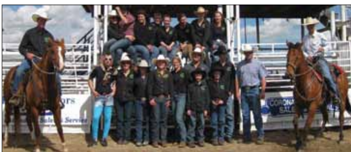
Members of the Coronation Range Riders at the club's June 2010 rodeo.