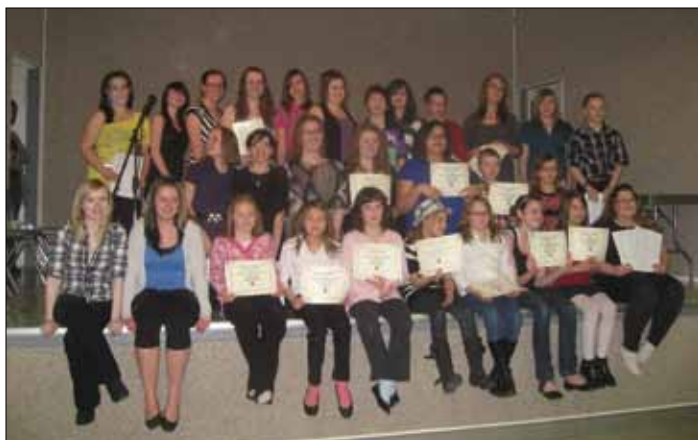
All 30 members of the Grande Prairie 4-H Multi Club on Public Speaking Day.