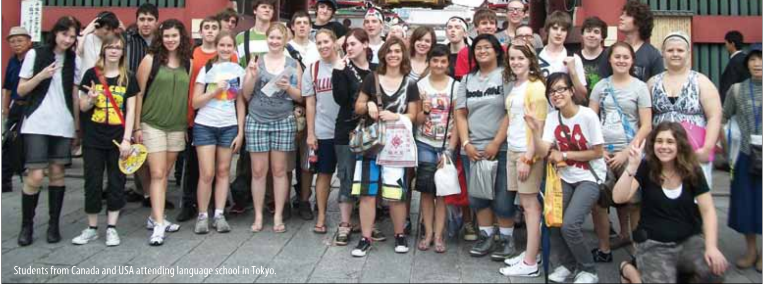
Students from Canada and USA attending language school in Tokyo.