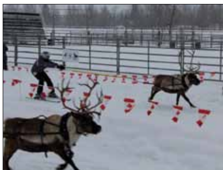
"On Reba, on Rowdy, on Newt, Normy and Martha!" Funny, it doesn't have quite the same ring to it, does it?

Wind in your hair, snow ripping past underneath your feet as you hold on to a reindeer in front of you - crazy, right? Well it just so happens that this is exactly what the 4-H Millarville Mutts and Mustangs and other 4-H club members did at the Reindeer Races held on December 18, 2010, at the Millarville Racetrack. They had tons of fun with all the games the 4-H seniors had set up like tug-of-war, toboggan races and relay races - they even had hayrides and a camp fire!