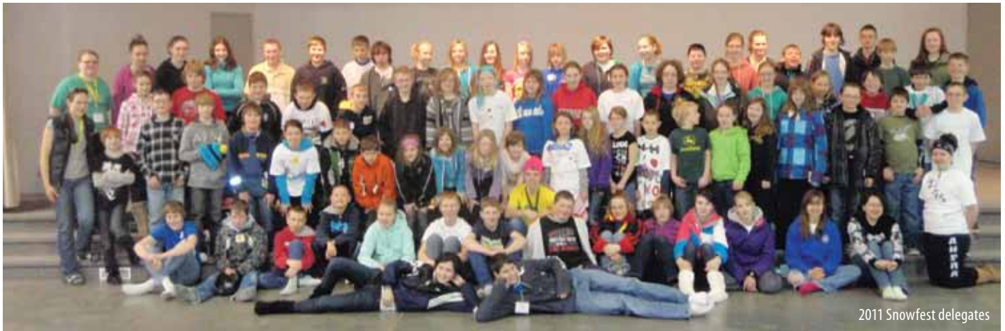
2011 Snowfest delegates