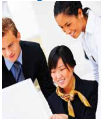
Business Administration Diploma