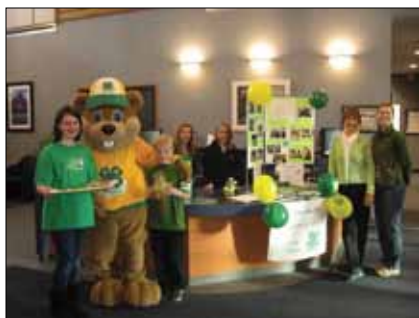
The Foothills Performing Arts 4-H Club's ATB Financial display.