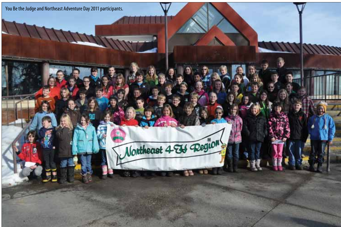
You Be the Judge and Northeast Adventure Day 2011 participants.

During the NE Adventure day, the members were treated to the Project Display competition that is open to all members to enter. Everyone in attendance was allowed to judge the project