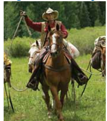
Western Recreational Rider Certificate