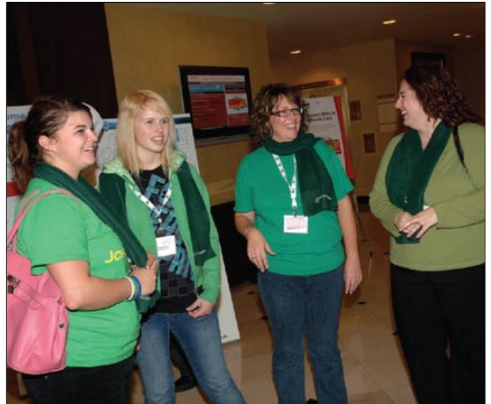
Wide smiles, great laughter and the colour green - three 4-H staples.

From everyone at the Canadian 4-H Council, have a great holiday season and a very Happy New Year! 🍀