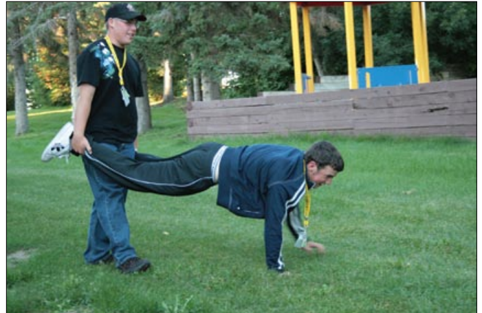
Key Members work on teamwork and trust at their annual training weekend...