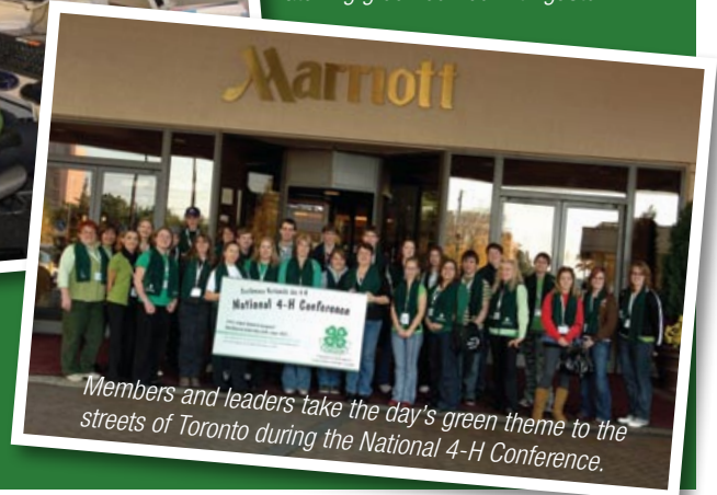
Members and leaders take the day's green theme to the streets of Toronto during the National 4-H Conference.