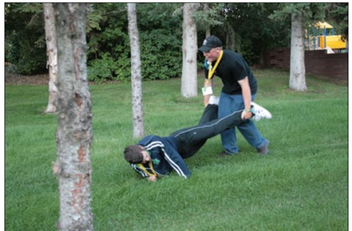
A work in progress, really.