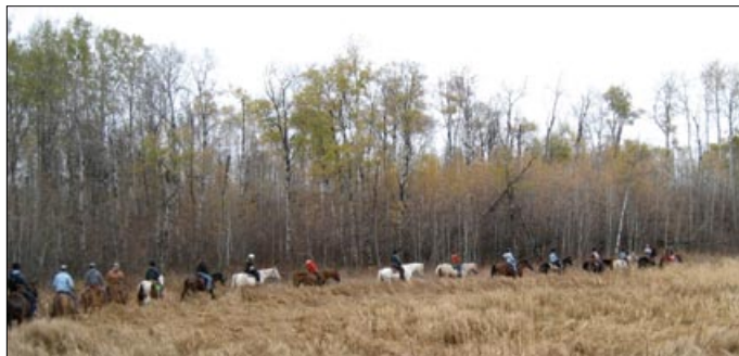
Members of the Colchester Crusaders kickoff their club year with a trot along the trails at Ministik Lake Bird Sanctuary.