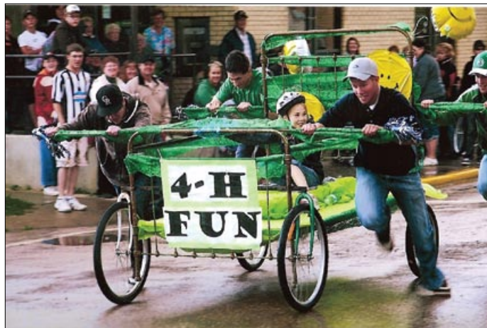
Running to the finish line at the Oyen Bed Races.

Hummingbirds are the only birds that can fly backwards.