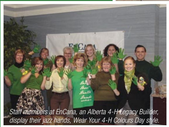
Staff members at EnCana, an Alberta 4-H Legacy Builder, display their jazz hands, Wear Your 4-H Colours Day style.