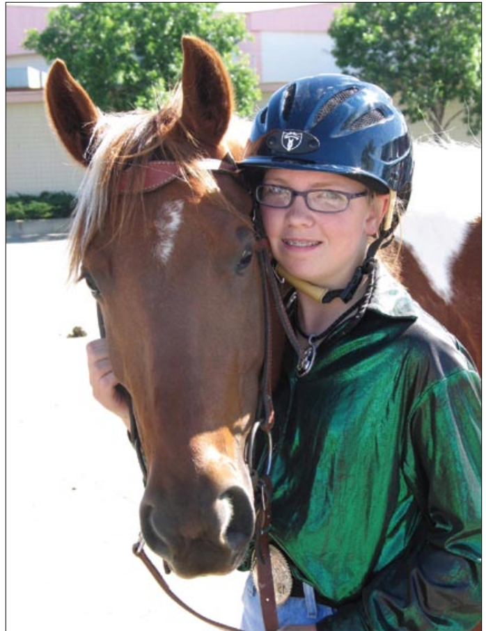
An action as simple as putting on a helmet could very well save your life.

Statistical research came from the video "Every Time, Every Ride" (Washington State 4-H Foundation)