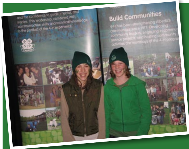
Be Seen in Green: 4-H members attending Northlands' Farmfair, October 31 to November 8, 2008, visited the Alberta 4-H booth, all decked out in their green get-ups.