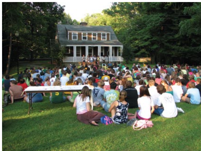
Members reflect on their thoughts and day's events during Reflections

And so, while some of the wind in our sails had been lost, determined we were! And then, a lonely email arrived from a 4-H group in West Virginia. They too had their exchange fall apart. Thanks to some Canadian 4-Hers who had left a great impression of Canada at the National 4-H Conference, our two groups decided that this exchange was going to be a go.