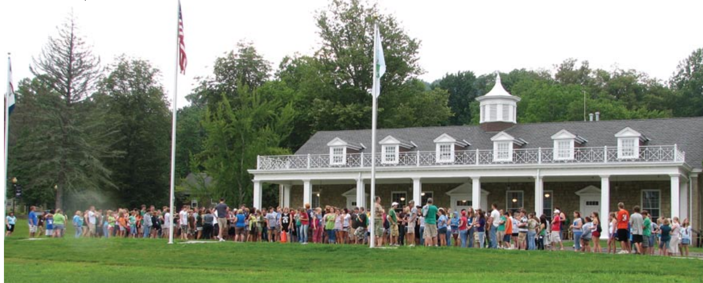
WV State 4-H Camp at Jackson's Mill

All members, from the time they started going to camp, were assigned a tribe (Seneca – turtle, Mingo – bear, Cherokee – crescent moon and star, Delaware – thunderbird, while the tribe leaders and group organizers (adults) were the Chiefs and Sagamores, all of which collectively comprise the Big Foot