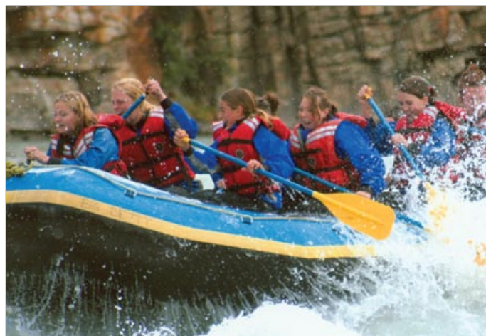
Members and chaperones from Bluffton and Thorndale fearlessly face the white water rapids.

Highlights from our trip included touring the Toronto harbour, going up the CN Tower and watching a Blue Jays game, which the Jays proceeded to win, at Rogers' Centre. One of the families invited us for a BBQ and some swimming at their cottage on Lake Huron. Another highlight was our day at Niagara Falls – wow! We learned about the major hydro plants on the Niagara River, and even got to tour the Ontario Power