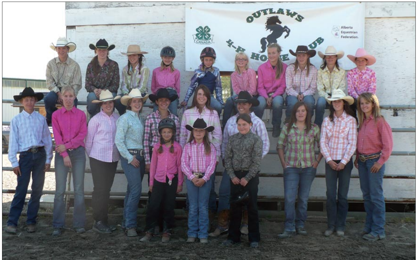
Members from the Outlaws 4-H Horse Club.

For those members not able to attend our Gymkhana this year, we look forward to hosting you next year! 🍀