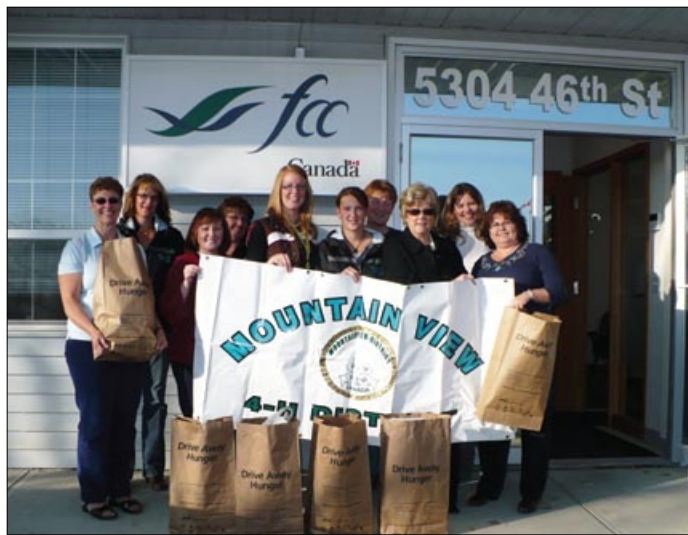
Members of the Mountainview 4-H District display the haul of donations that their food drive efforts yielded.