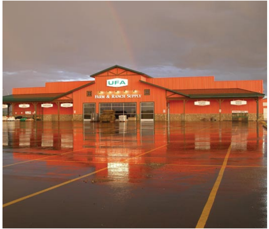
UFA Farm and Ranch store in Stettler, Alberta