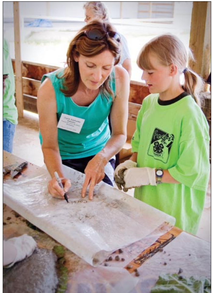
Learning to do by doing ensures that members feel empowered rather than embalmed.

The first common theme from the Club Week delegates was that members should run the meetings with some assistance