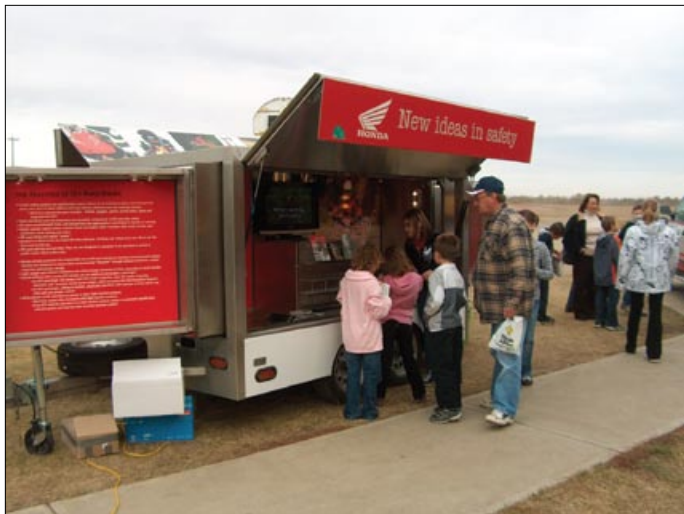
ATV Safety Presentation: Members and parents alike were educated on the aspects of ATV safety.