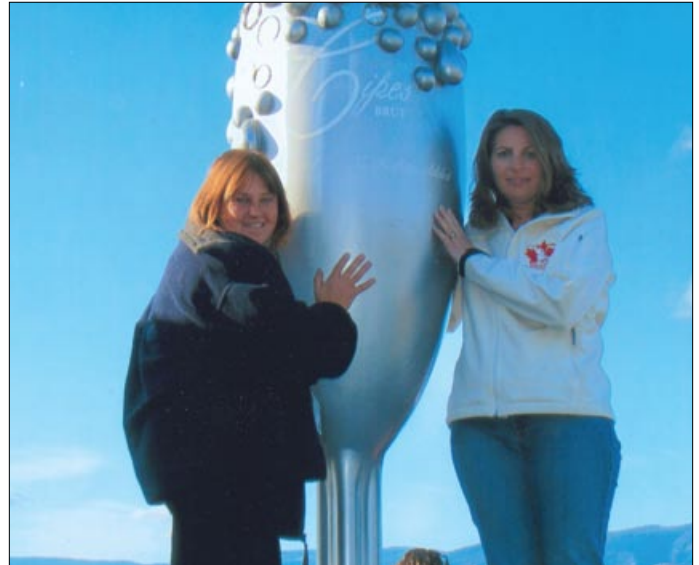
Touring a local winery was one of the highlights of the B.C. Leaders' Conference.

During the conference we were kept busy with different activities such as fun team-building games, informative sessions and guest speakers. We were entertained by the talents of a young, local magician and treated to a wine tour at the Summerhill Winery. The conference definitely gave 4-H leaders the opportunity to have fun, increase their knowledge, share ideas, and become energized for the upcoming 4-H year.