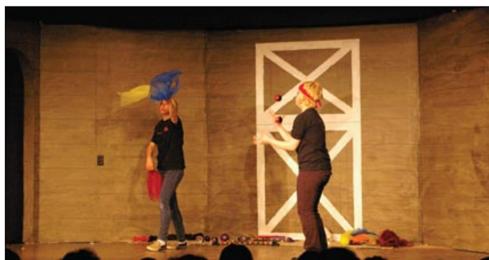
Variety is the spice of life, which members of Heisler Hemmers proved when they took their talents to the stage.

The 4-H members behind this successful event are great examples of what the future generation of philanthropists will look like. They know that making a difference in their community is about using their creativity and drive to do something extraordinary. Having fun while you're making a difference is just icing on the cake! 🍀