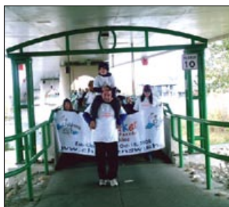
The Walk for Wishes parade heading up the final stretch of the walk.