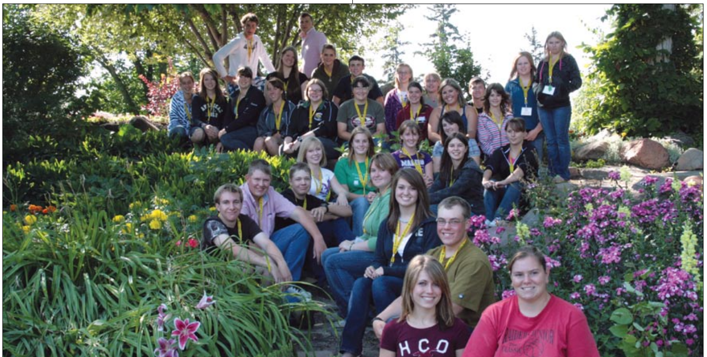
2008-2009 Key Members