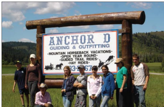
Members and parents of the Cold Lake 4-H Light Horse Club had a great time "roughing" it on their two-day ride.

trails and open fields of wild flowers! It was a truly rustic experience, complete with lean-to tents and outhouses. We all agreed that it was well worth our fundraising efforts and would love to return! 🍀