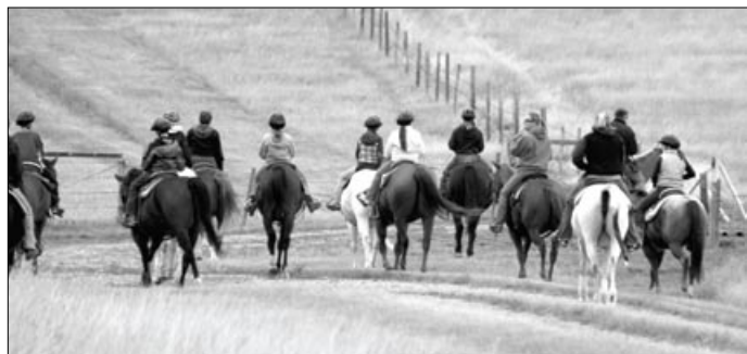
Members of the Medicine Hat 4-H Light Horse Club participating in their club's annual trail ride.

After an hour of riding, we returned to eat lunch, then saddled up again and went out for another ride. It was a great start to what promises to be a great year for the Medicine Hat 4-H Light Horse Club. 🍀