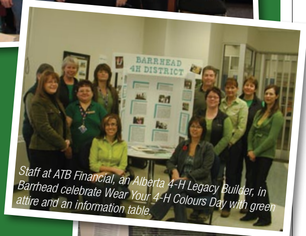
Staff at ATB Financial, an Alberta 4-H Legacy Builder, in Barrhead celebrate Wear Your 4-H Colours Day with green attire and an information table.

Thank you to all 4-H members, leaders, volunteers and sponsors, nationwide, who participated in what was another successful "Wear Your 4-H Colours Day" event.