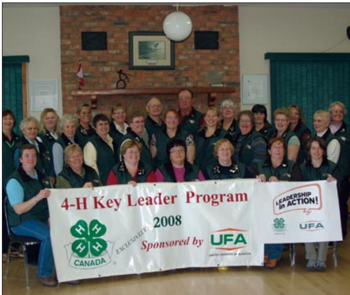
Alberta 4-H Key Leaders for the 2008-2009 club year