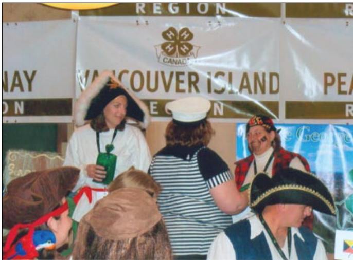
Piracy was the order of the day at the B.C. Leaders' Conference.