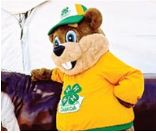
Clever the Poet