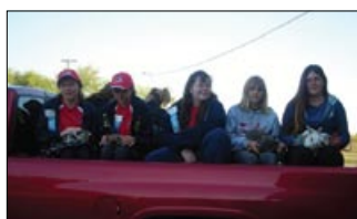
The Southpaws in the Chestermere Country Fair Parade with bunnies in hand.