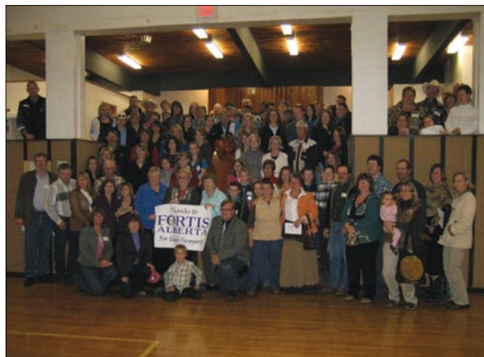
A large number of members, leaders and volunteers were in attendance for the 2008 South Regional Celebration.

provincial 4-H scholarships came from the Southern Region, with 15 successful southerners at that level. Congratulations to all scholarship recipients and good luck to all 4-H members pursuing post-secondary education. Remember your 4-H roots as you hit the next stage in your life!