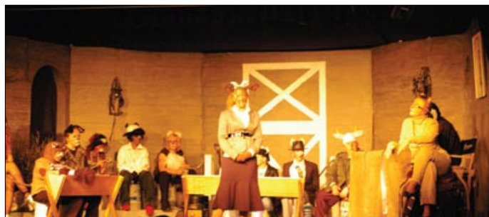
4-H members stage a scene for a very good cause.

Collaboration highlights the best of what partner has to offer.