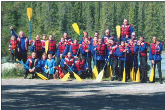
Mission accomplished – check “conquer white water rapids” off of today’s to-do list.

What a great experience for all of us! We strongly encourage other youth to take part in a 4-H exchange. We made many new friends and lifelong memories! 🍀