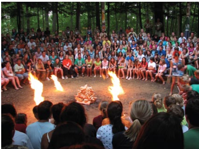
In a scene right out of "Survivor" the group attends Tribal Council

tribe). Each tribe learnt their song (along with a number of others) and proceeded to chant these at the tops of their lungs, trying to outdo all of the other tribes! The whole time it was like being in a huge pep rally.